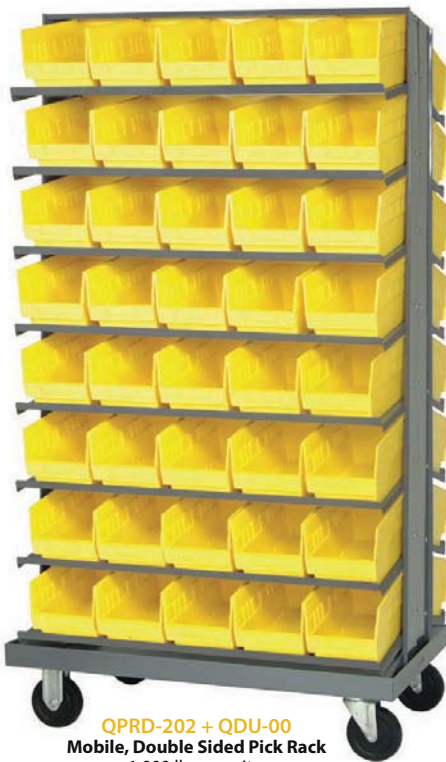
QPRD-202 + QDU-00 Mobile, Double Sided Pick Rack 1,000 lb. capacity.