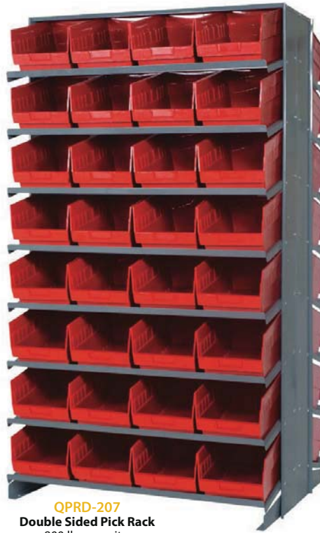
QPRD-207 Double Sided Pick Rack 800 lb. capacity.