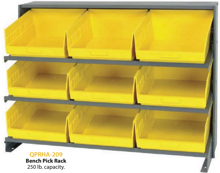
QPRHA-209 Bench Pick Rack 250 lb. capacity.

Pick Racks provide a convenient high density, easy access, sloped shelving system, available as bench units, single and double sided free standing and mobile units. Unit comes complete with STORE-MORE 6" H Shelf Bins. Sloped shelving unit keeps small and medium sized parts easily accessible. Open hopper front bins with label area, provide fast access to stored items. This all-in-one unit is easy to clean and will not rust or corrode. See chart for configurations. Bins are available in 4 colors. One bin color per unit.