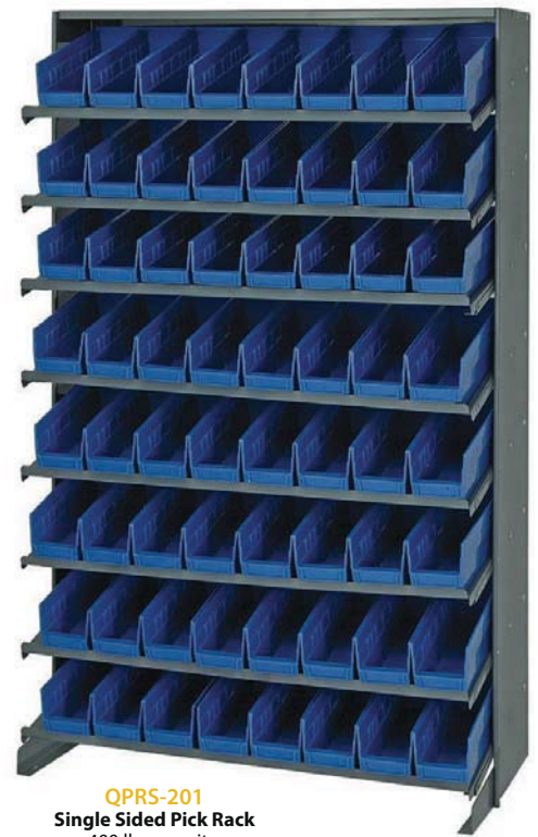
QPRS-201 Single Sided Pick Rack 400 lb. capacity.