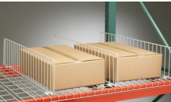
Kwik Klip Dividers